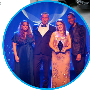
The Batmobile (above) at the Redditch Motor Show 2023, and a winner (left) at the Redditch BID Business Awards 2023.